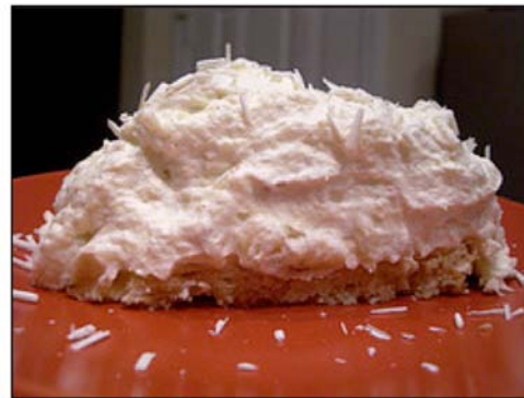
Soby's White Chocolate Banana Cream Pie Originally uploaded by watchjennybake .

This is typical of restaurant recipes because so much of it can be made ahead of time. I made the crust and pastry cream